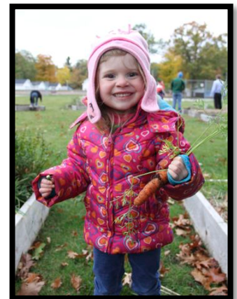
Harvesting carrots in the garden

This year our farm to school program visited nine classes in grades K-4. Students learned about the parts of plants , types of soil, the importance of physical activity , and much more! Students also prepared smoothies, bean dip and a Three Sisters soup in class , and got to meet local food entrepreneurs and taste their products. Throughout the fall and spring, we engaged students in garden-based learning .