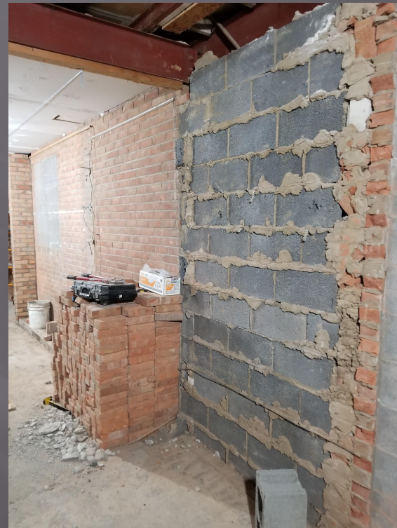
Existing corridor wall construction and salvaged brick.