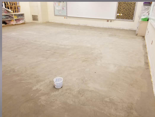
Classroom floors prepped.