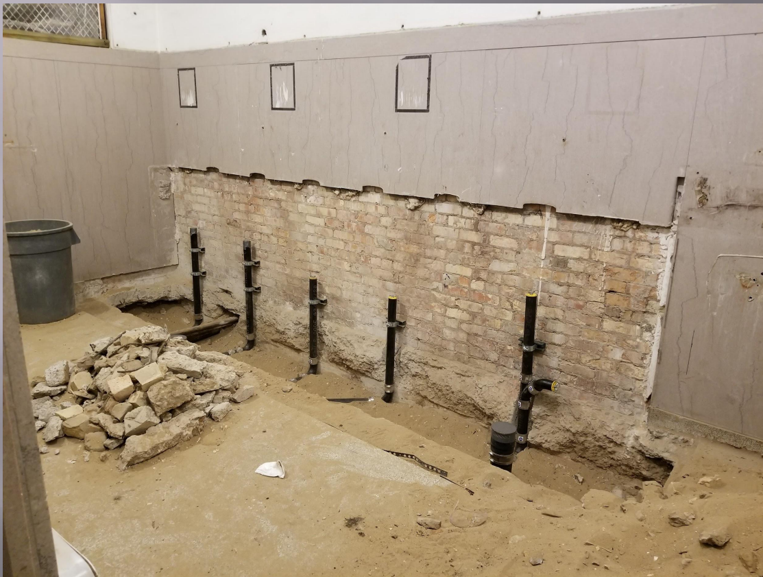
Restroom renovations. Upgrades include new piping, supply and waste.