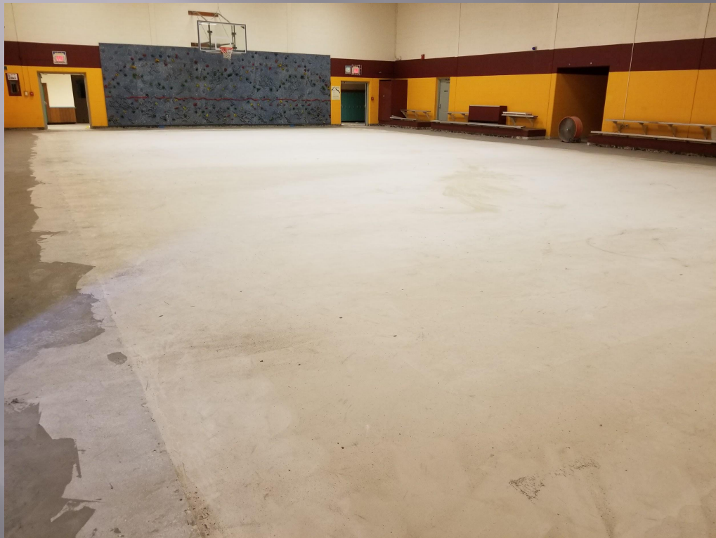
Floor leveling, next step new flooring.