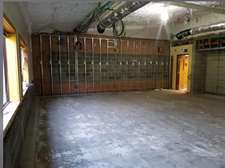
Typical classroom renovations.