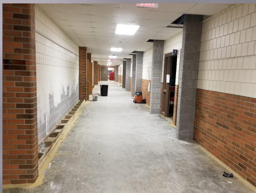
Corridors ready for lockers and finish flooring