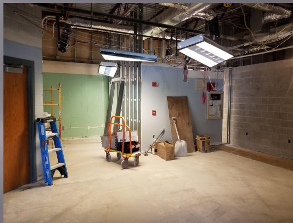
School Store (Old Main Office)