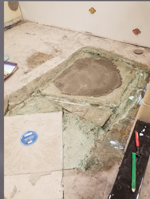
Uncovering the unknown, an old shower bases in the floor of two of the restrooms under construction.