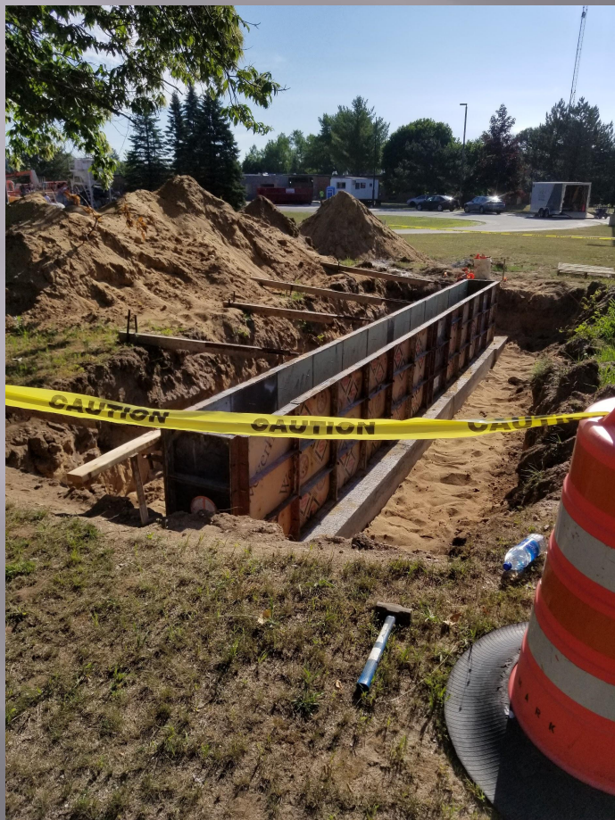
New sign at Fisher Road