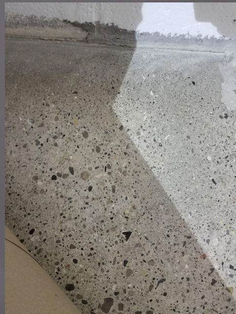
Art Wing polished concrete finish floor