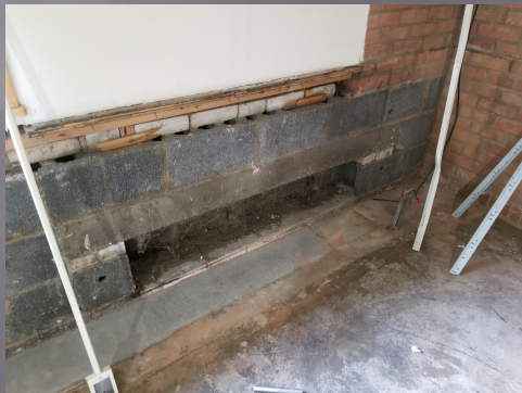
Phase II Renovations