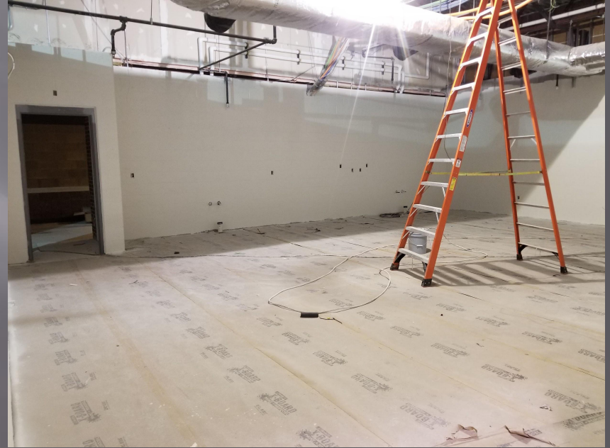
General Arts Classroom