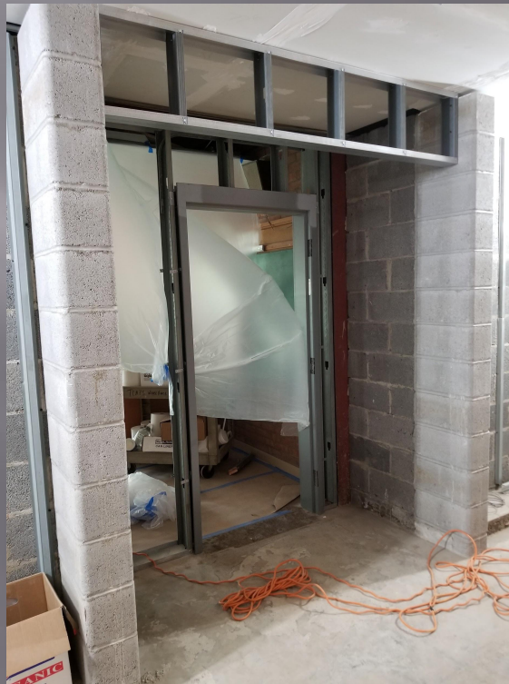
Typical classroom entryway renovations.