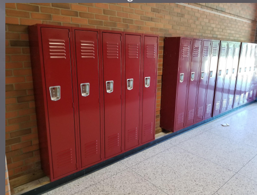
Lockers going in.