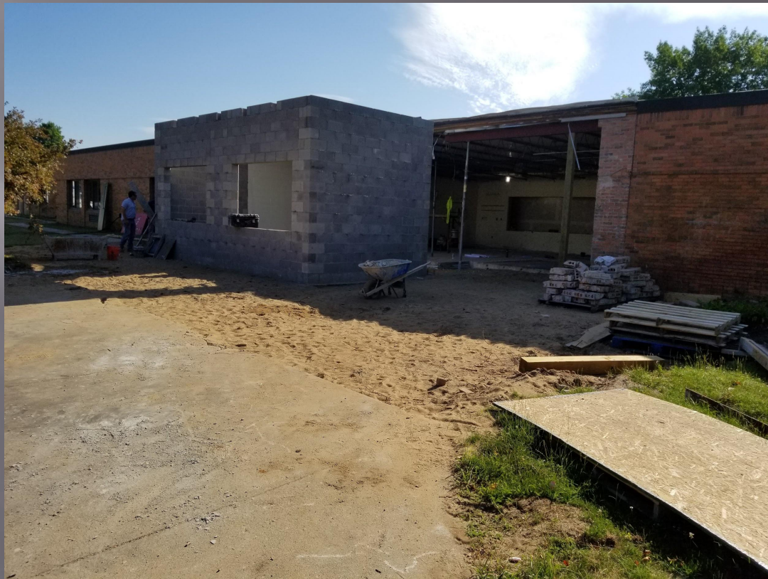
New offices taking shape.