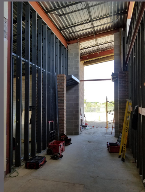
New interior corridor