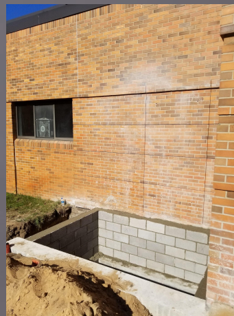
Media Center Flooring Installed