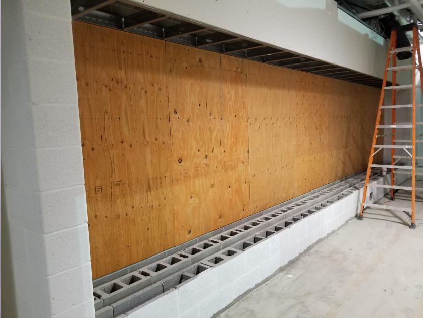
Display Wall in Corridor