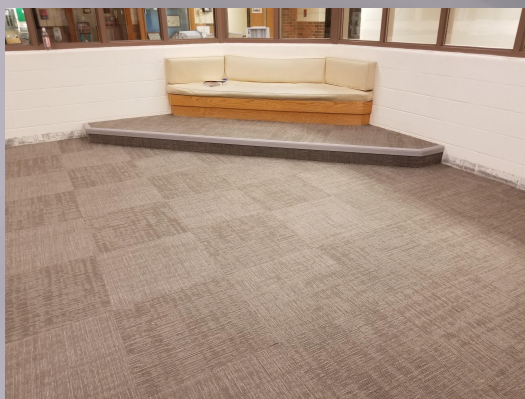
Media Center Flooring Installed