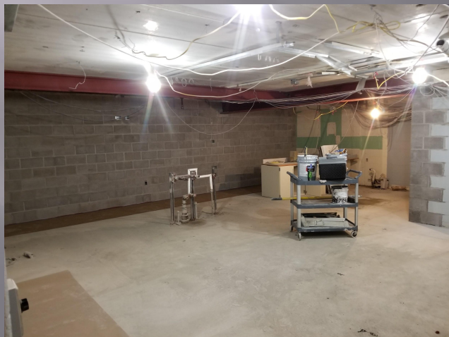
Flex Classroom (Old Main Office)