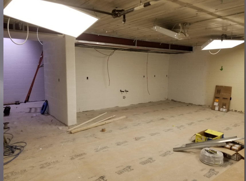
Media Prep and Storage