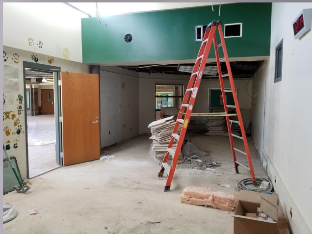
Learning Center (Old school store & Conference Room)