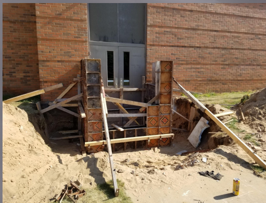
Gym entrances upgraded to prevent water intrusion.