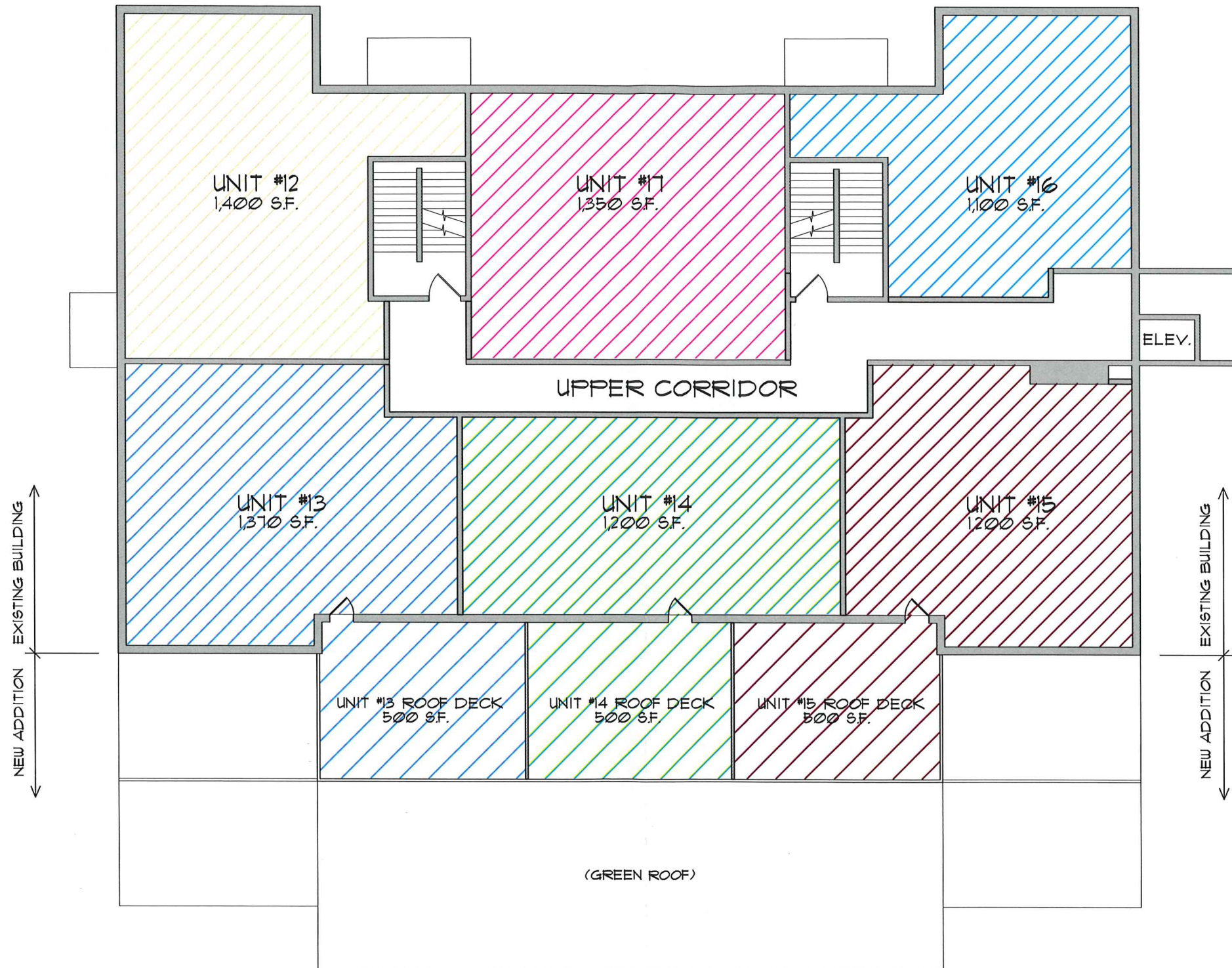
BOARDMAN SCHOOL UPPER LEVEL FLOOR PLAN SCALE: 1/16" = 1'-0"

HABITABLE SQUARE FOOTAGE: UPPER LEVEL REHAB AREA = 9,200 S.F. TOTAL BUILDING SELLABLE UNITS = 24,510