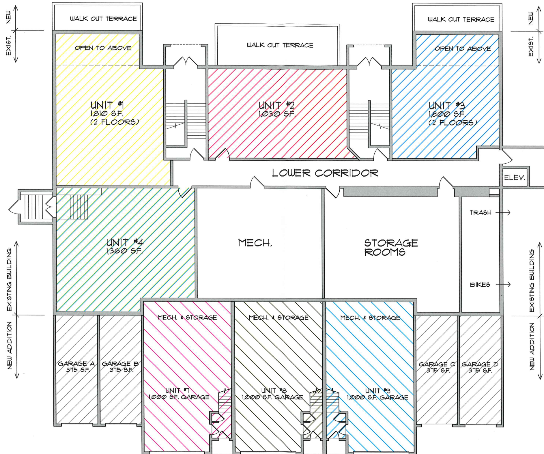
BOARDMAN SCHOOL LOWER LEVEL FLOOR PLAN SCALE: 1/16" = 1'-0"

HABITABLE SQUARE FOOTAGE: LOWER LEVEL REHAB AREA = 6,300 S.F. TOTAL BUILDING SELLABLE UNITS = 24,510