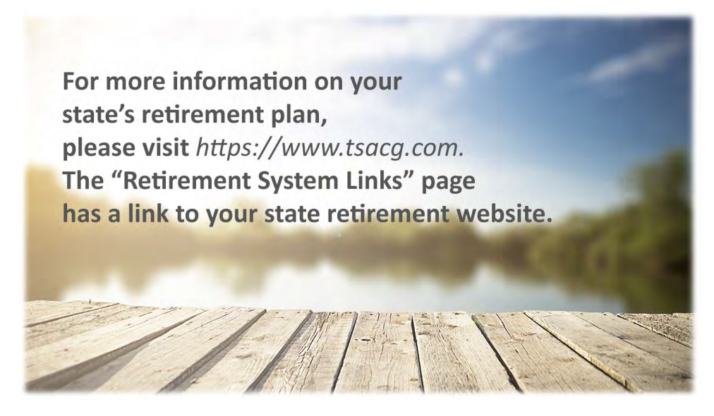
Note: Your state retirement system is not associated with your supplemental retirement account or U.S. OMNI & TSACG Compliance Services

Hybrid (Combined) Plans are a combination of a defined benefit plan and a defined contribution plan. Generally, the employee contributions are a defined contribution plan and the employer contributions are a defined benefit plan; however, the combinations available vary from plan to plan.