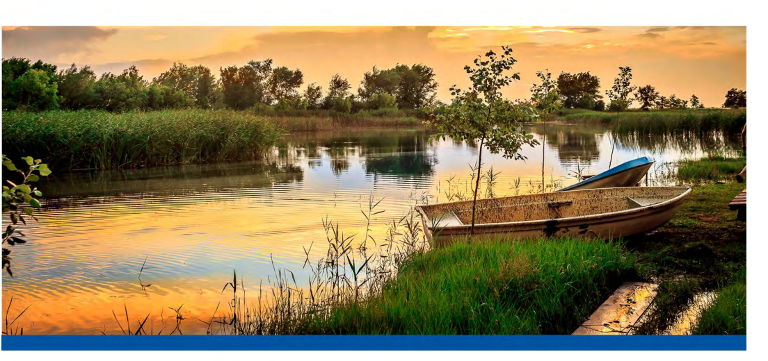
Traverse City Area Public Schools